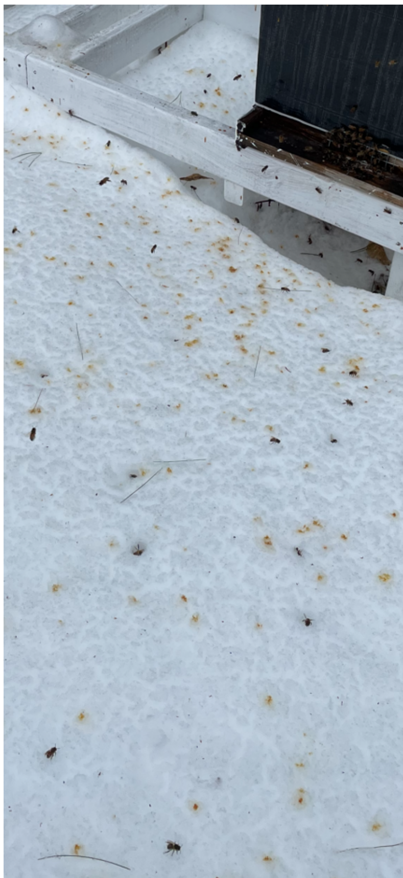
Bee poop in front of a hive. Photo taken by Mr. McFadden on 3 Feb. 2022.

Do you know the saying don't poop where you eat? Bees follow this rule. The problem is that if they leave the cluster in the winter to poop outside, on most days they'll freeze to death. Therefore, they need to hold their bowels until a warm enough day in the winter arises...about 40 degrees Fahrenheit. When the temperature is just right, they will pile out of the hive and take a cleansing flight. This is the fancy way of saying that they take a massive bathroom break outside. The result is a giant orange mess outside of the hive. Gross. But also, pretty awesome.